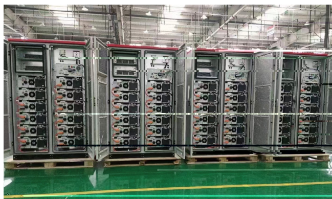
Figure 1: Project Photos

Located in 5 industrial parks, the 25 sets of JinkoSolar' s SunGiga liquid cooling storage system (ESS) coupled with renewable energy contribute to grid stability. In addition, the high price of electricity during peak period in Guangdong Province brings a considerable amount of electricity expenses to enterprises, so these 5.375 MWh products play a key role in peak shaving and valley filling.